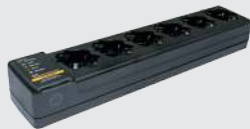
PMLN7102 / PMLN7162